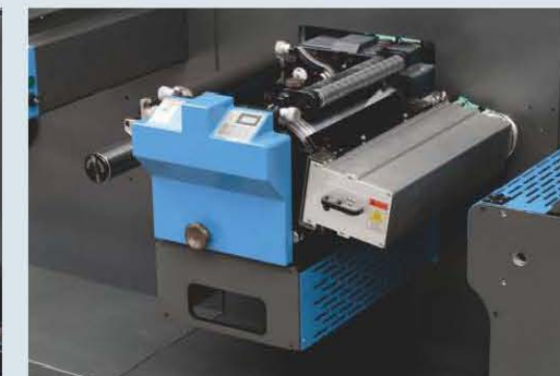
UV Varnish Station